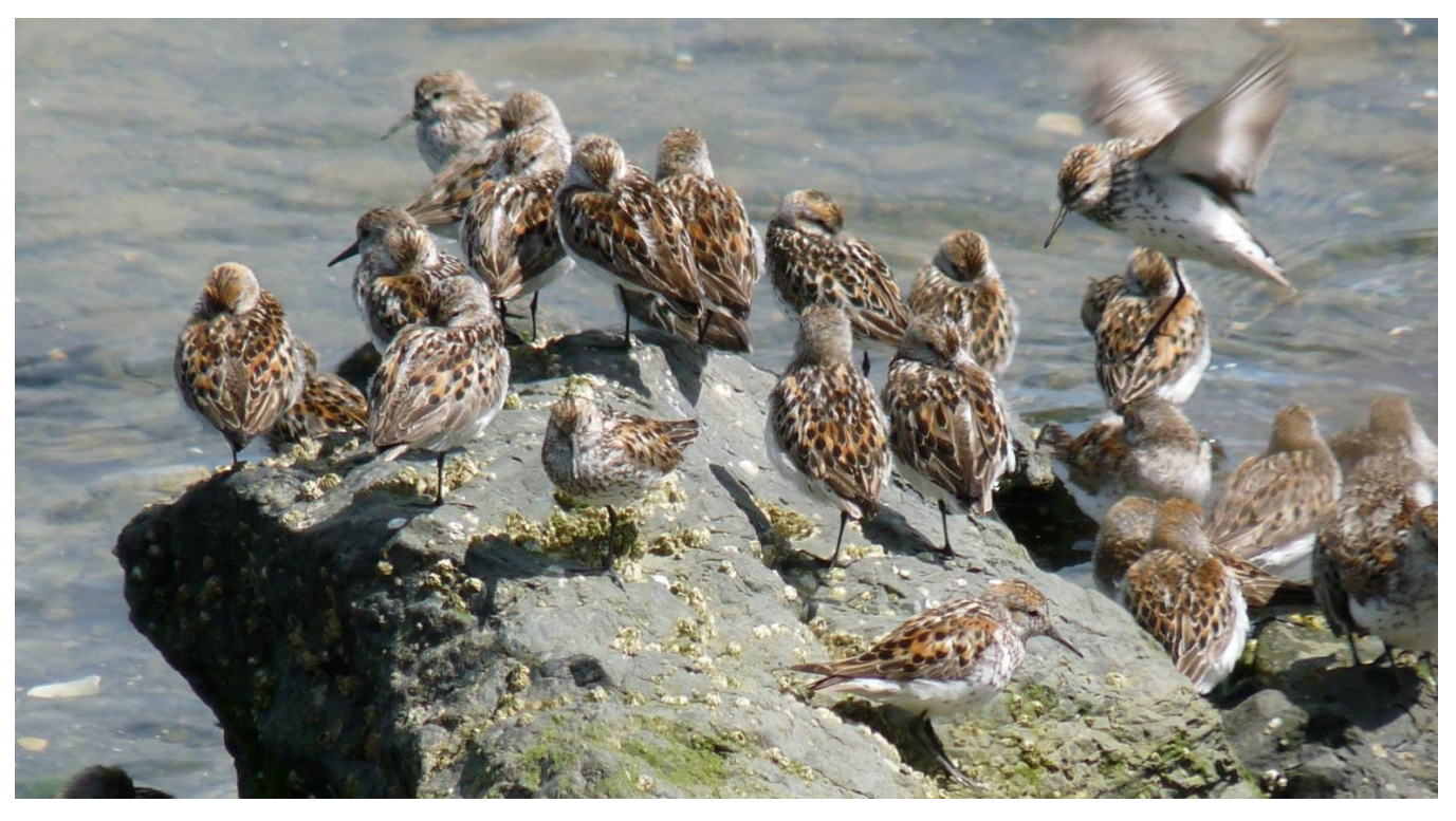
Western Sandpipers are among the shorebirds common in the Vancouver area in August

(en cas de désaccord, l'anglais prévaut)