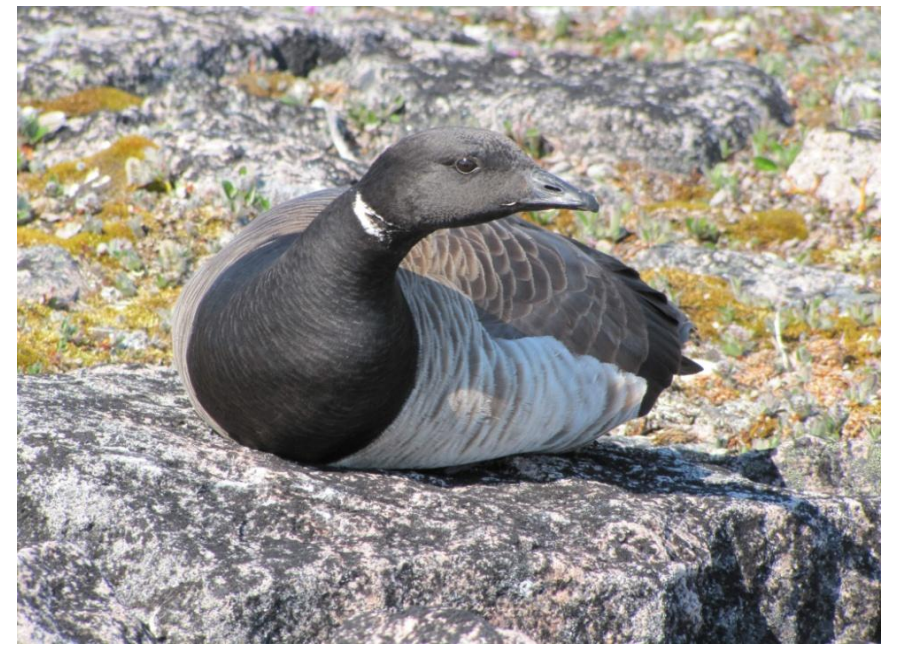
Brant in Nunavut

followed individuals, we searched for grouping of departure times and bearings for different time spans and analysed the influence of nest position within the colony on the food type brought to the chicks. We found that gulls nesting in the same neighbourhood did not exhibit temporally clumped departures nor did they tend to leave in the same bearing as their previously departing neighbours. The food types brought to their chicks was similar for all gulls, regardless of their position in the colony. We conclude that no information appears to be obtained from nest neighbours but we could not exclude the occurrence of information sharing at other locations of the colony. Stopovers on nearby water or along the shore of the colony after a short flight from the nest may allow exchange of information. As we found a relationship between feeding grounds and breeding sector on the colony, there could also be information sharing mechanisms that do not result in temporally clumped departures that must be explored in future studies.