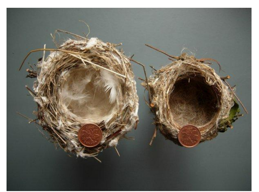
Figure 1: Representative nests of Yellow Warblers breeding near Churchill, Manitoba (left) and at the Queen's University Biological Station in southeastern Ontario. Nests from Churchill are larger, constructed with materials that provide good thermal insulation, and have thicker nest walls.

The observation of geographic variation in phenotypic traits has played one of the most significant roles in inspiring research and developing the underpinnings of evolutionary theory (Darwin 1859, Wallace 1878, Mayr 1963). Despite the extensive studies of geographic variation in phenotypic traits in birds, few studies (with the exception of intraspecific signaling) have experimentally tested the fitness benefits of geographically variable behaviours, precisely because of the difficulties associated with transporting small, flighty insectivorous birds. However, geographic variation in behaviours that result in a physical structure, such as the nest of birds, provide a unique opportunity to test the benefits of geographically variable behaviours (Dawkins 1982). Below, I describe my master's research that uses reciprocal nest transplant experiments to examine the selective mechanisms favoring divergent nest building behaviours of Yellow Warblers ( Dendroica petechia ) breeding near the town of Churchill in northern Manitoba and at the Queen's University Biological Station (QUBS) in southeastern Ontario.