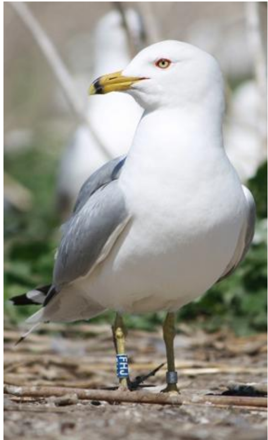
Figure 1: Gulls are marked with blue or yellow plastic bands with 3 alphanumeric codes

Martin Patenaude-Monette and Jean-François Giroux, Université du Québec à Montréal (UQAM) e-mail: <u>patenaude-monette.martin@courrier.uqam.ca</u>.