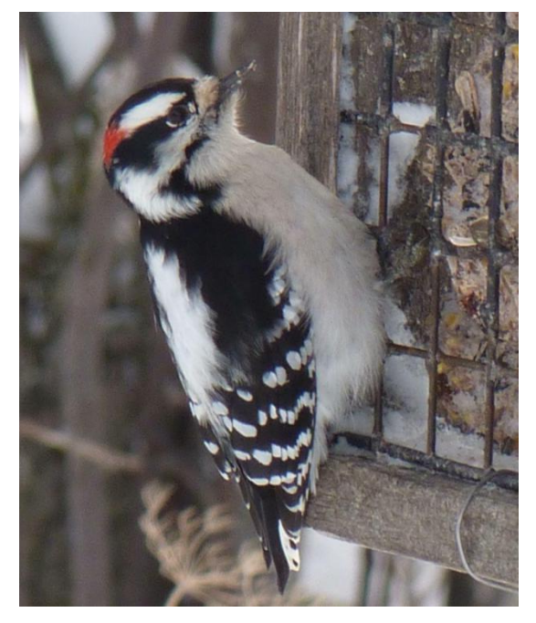
Downy Woodpecker