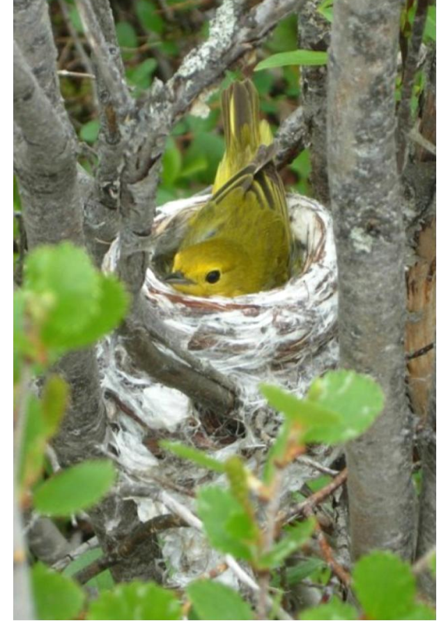
Figure 2: Female Yellow Warbler sitting on the nest she constructed near Churchill, Manitoba

Briskie, J.V. 1995. Nesting biology of the Yellow Warbler at the northern limit of its range. Journal of Field Ornithology 66: 531–543.