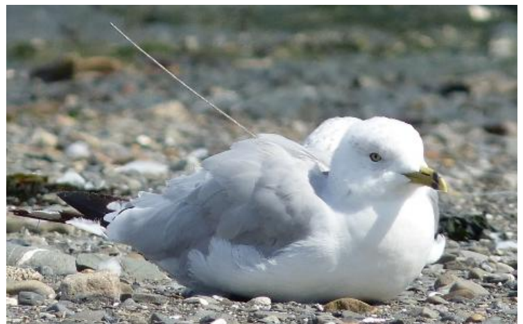
Figure 2: A gull fitted with an Argos-GPS PTT at Sainte-Flavie (near Rimouski QC) during the post-breeding dispersion in 2011

Our results will be used by Environment Canada to draft a first management plan for Ring-billed gulls in southern Quebec. A regional committee composed of stakeholders (landfill managers, municipalities, wildlife control companies, farmers' representatives, etc.) is also participating to the project by working within an integrated management framework. For more details about the project or to submit an observation, please visit our web site at <u>gull.uqam.ca</u>. You can also follow us on Facebook (<u>Goeland UQAM</u>) and Twitter (<u>Goeland UQAM</u>).