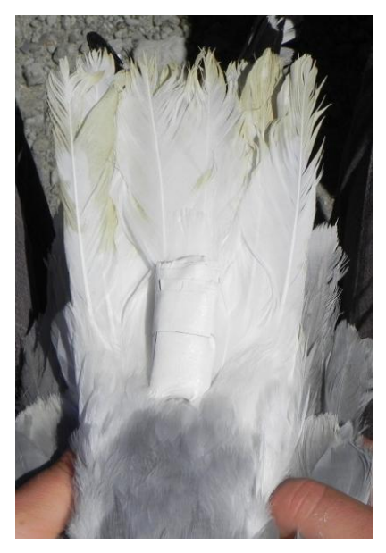
GPS data loggers were attached on the two median rectrices with waterproof tape

Patenaude-Monette, Martin. 2011. Caractérisation des habitats d'alimentation du Goéland à bec cerclé ( Larus delawrensis ) dans le sud du Québec. M.Sc. Thesis. Département des sciences biologiques, Université du Québec à Montréal, Montréal, QC.