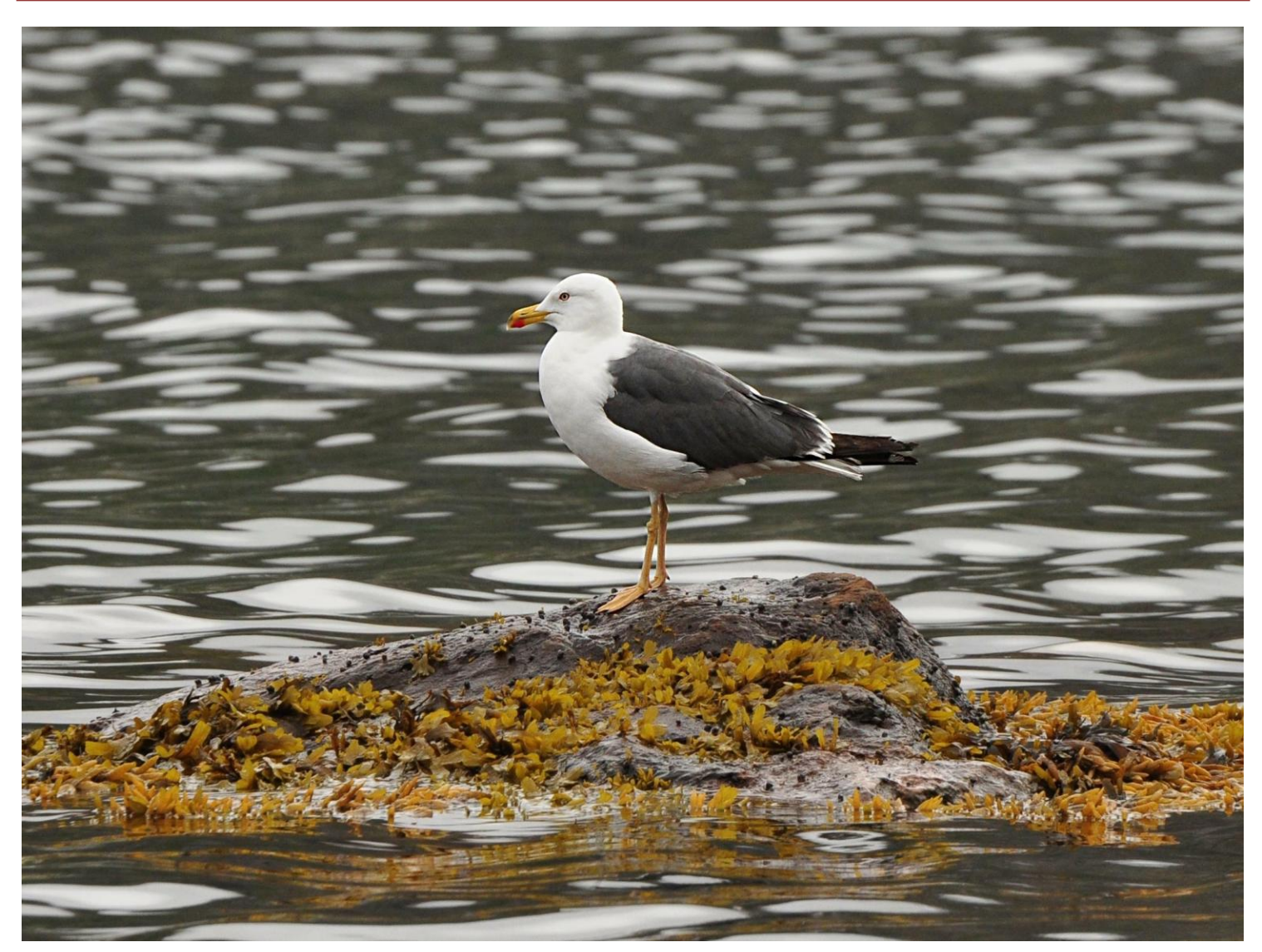
Lesser Black-backed Gull (Larus fuscus)

Bulletin of the Society of Canadian Ornithologists • Bulletin de la Société des Ornithologistes du Canada