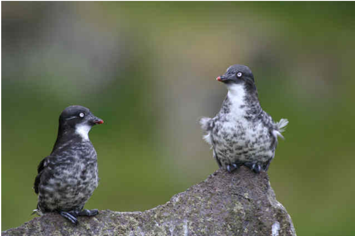
Least Auklets.