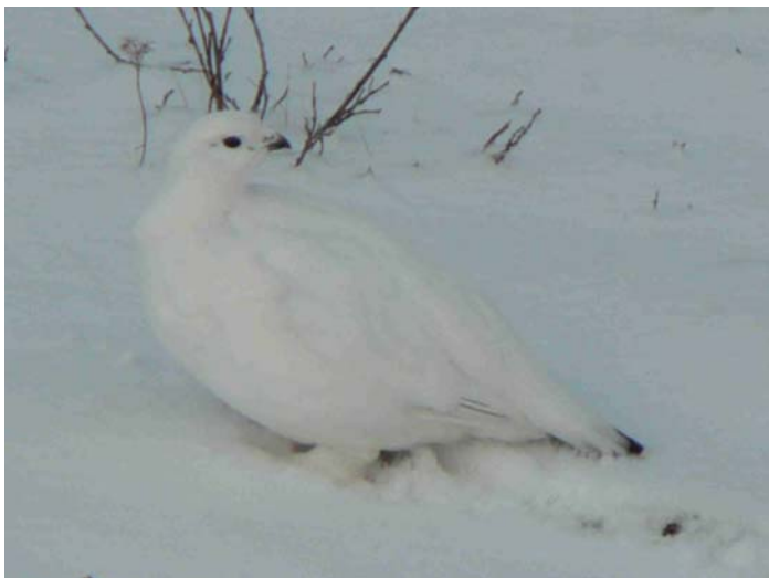
Willow Ptarmigan.

More information on the AOU website: http://www.aou.org/