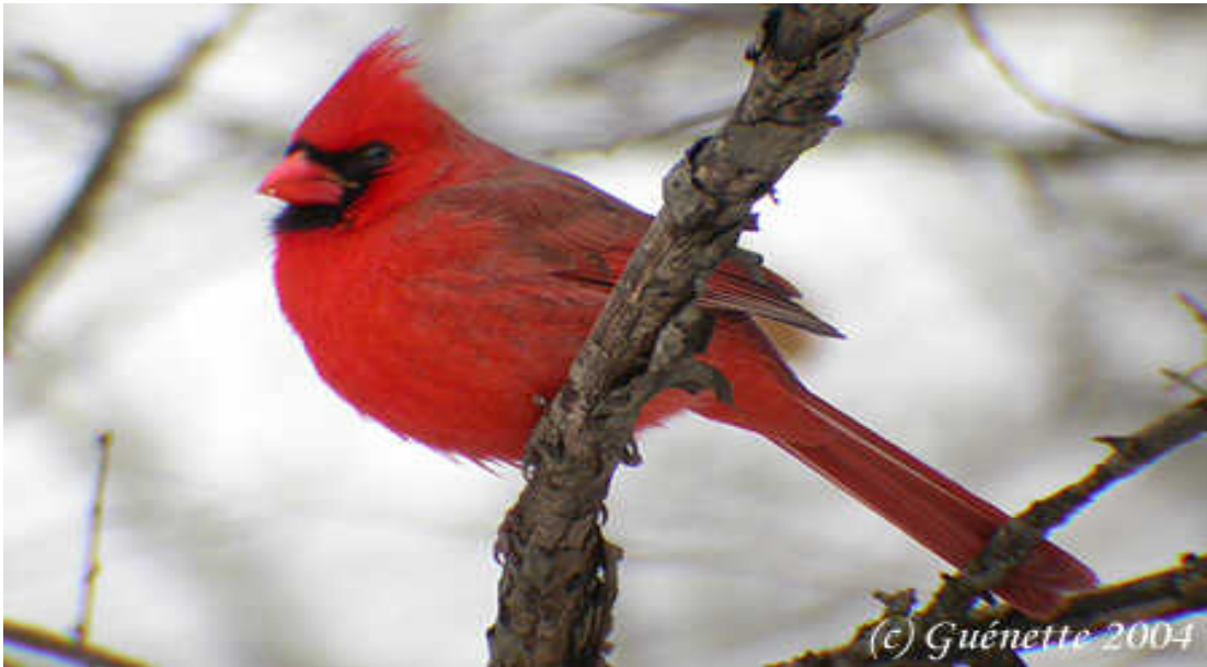
Northern Cardinal.

Picoides, December 2007 Volume 20, Number 3