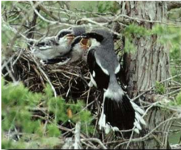
Loggerhead Shrikes.