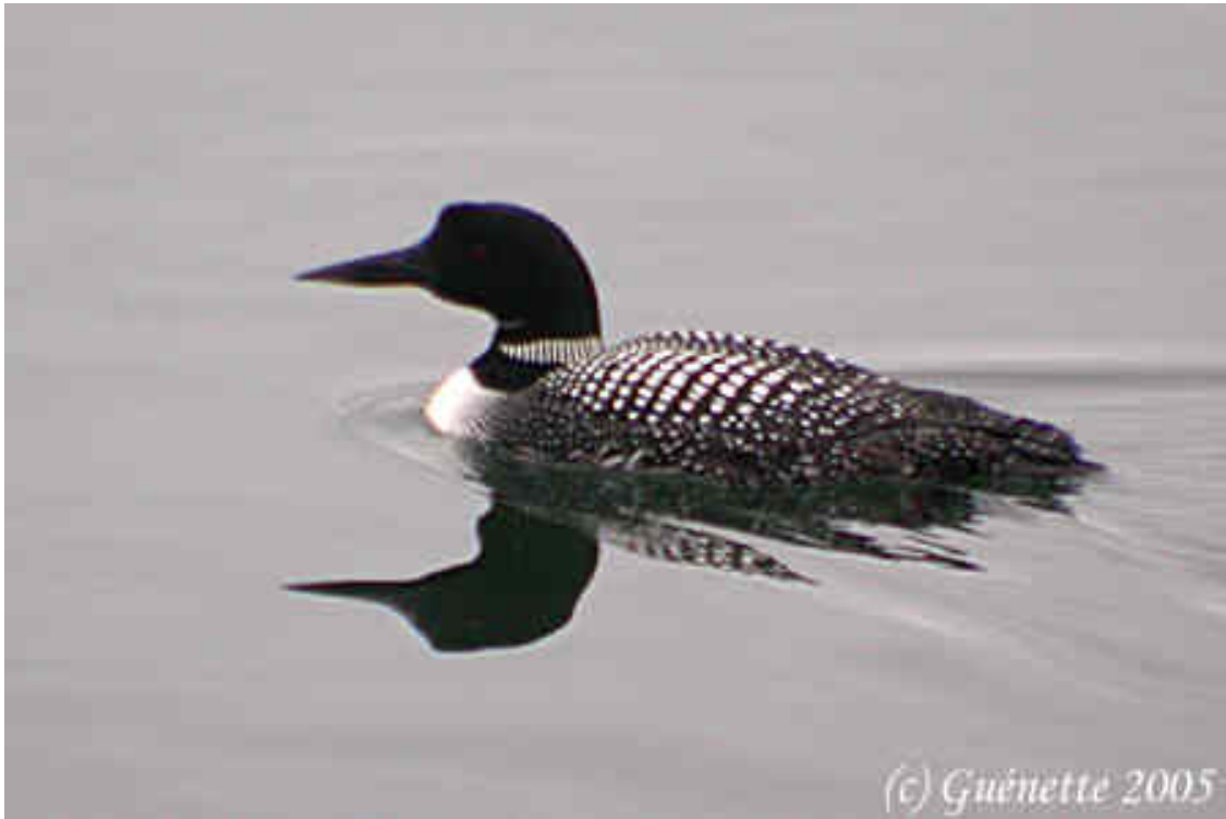
Common Loon.