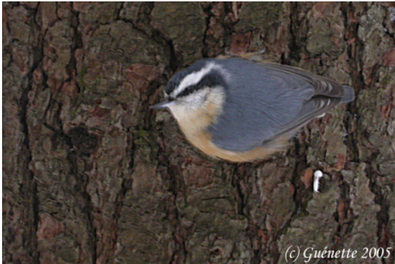
Red-breasted Nuthatch.

by SCO members to ensure that the text of this oration be entered into the printed record; it is provided here for that purpose: