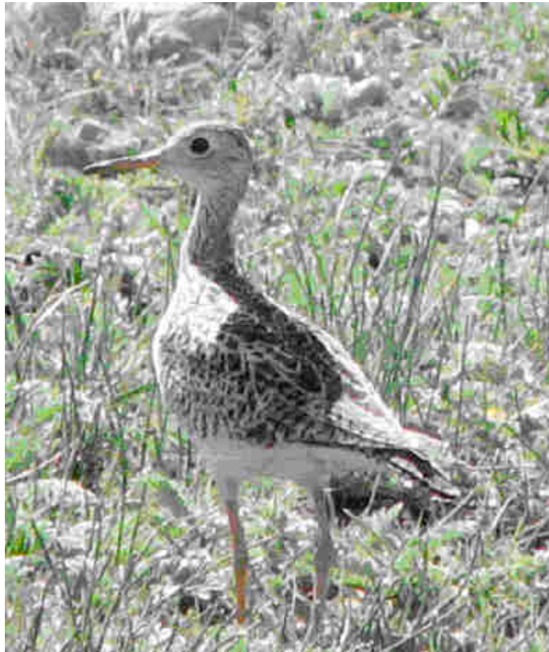
Upland Sandpiper.