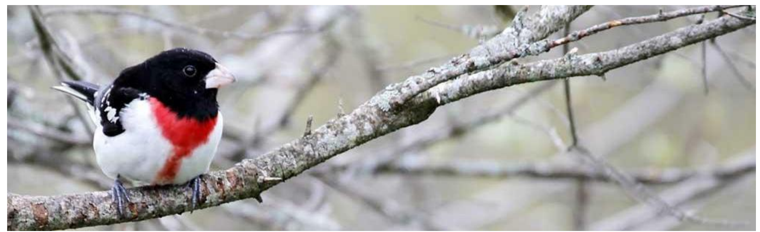
Rose-breasted Grosbeak

Broad front migration was defined as a migratory movement through a broad geographical area that was maintained at constant heading and airspeed regardless of changes in topography. There was considerable variation among sites in each of the mean airspeeds, mean headings, and degree of scatter in those headings of birds crossing the Gulf of Maine. This variation was partly governed by variation in wind direction among nights, where migration more closely matched a broad front on nights with westerly wind versus nights with easterly winds. Collectively, these results are consistent with previous findings that wind conditions influence migratory flight behaviours at a regional scale, and refute the hypothesis of broad front migration at the southern coast of Nova Scotia.