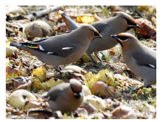
Bohemian Waxwings getting drunk on rotten apples