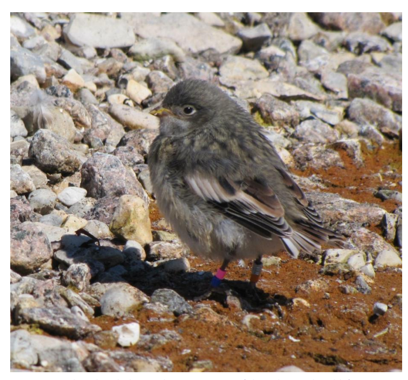
Colour-banded juvenile Snow Bunting

Proposals for workshops should contain the following details: workshop title; the names, institution or affiliation, addresses, phone, fax, email addresses of organizer(s) or instructor(s); a 300 word justification for why this workshop is important or useful to attendees; maximum number of participants; and time, space and resource (e.g., computing) requirements. Workshops will be scheduled either before, during (evenings) or after the main conference.