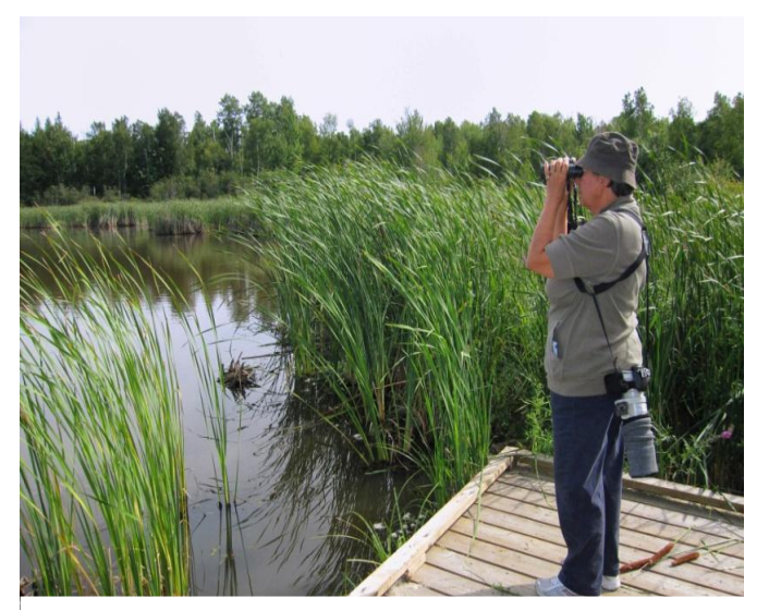
Volunteer observers are critical to the success of the GLMMP

In addition to population data, the GLMMP collects habitat data at various scales at each sampling point (e.g., aerial coverage of open water within 100 m, wetland size). These data allow assessments of marsh-nesting bird habitat use with sample sizes well beyond virtually any other study. Analysis to date shows that wetland size, the type of vegetation cover, and annual water level fluctuations influence many marsh bird populations. We plan to build upon these findings with more research in the future.