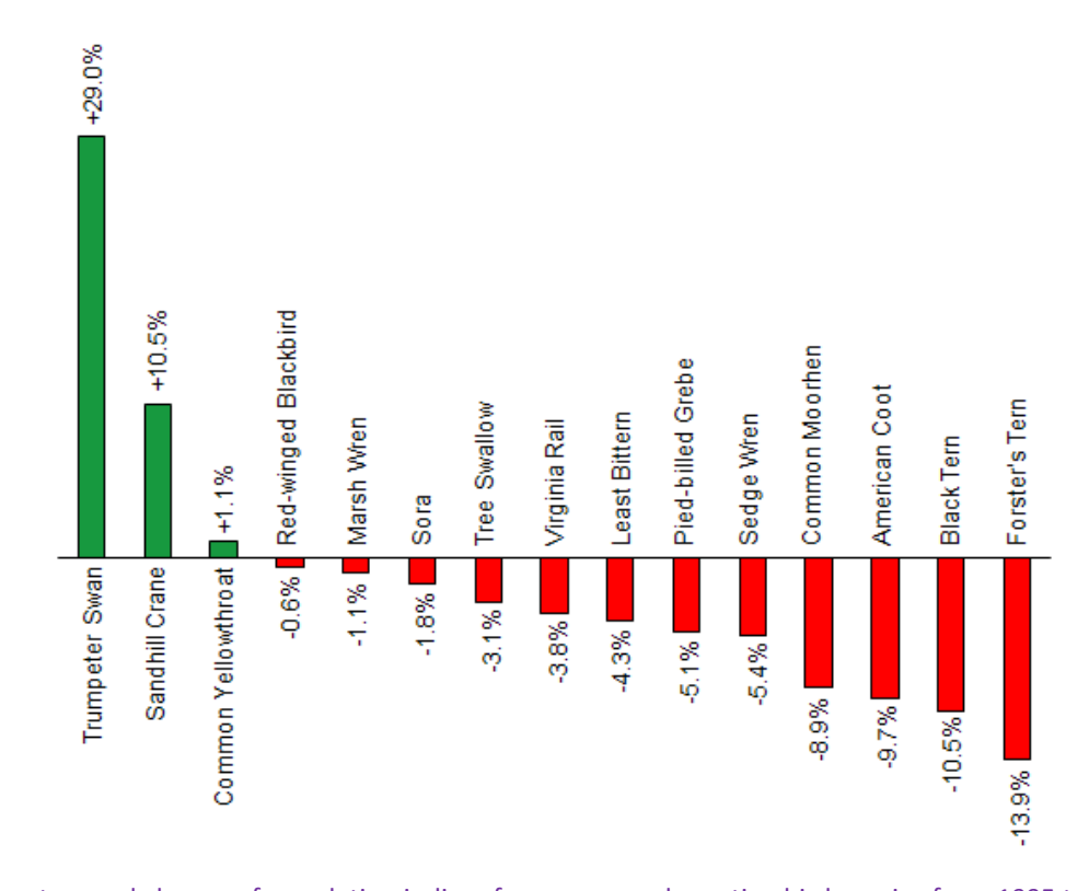
Fig. 2. Percent annual change of population indices for some marsh-nesting bird species from 1995 to 2010 in the Great Lakes basin. Indices estimated with a Bayesian mixed-model framework, assuming a Poisson distribution. All trends are statistically reliable.

For more results from the GLMMP and other monitoring programs run by Bird Studies Canada visit our online library at <a href="www.bsc-eoc.org/library.html">www.bsc-eoc.org/library.html</a>. The GLMMP would also like to thank Environment Canada, US Environmental Protection Agency, and TD Friends of the Environment Foundation for financial support for 2011-2012.