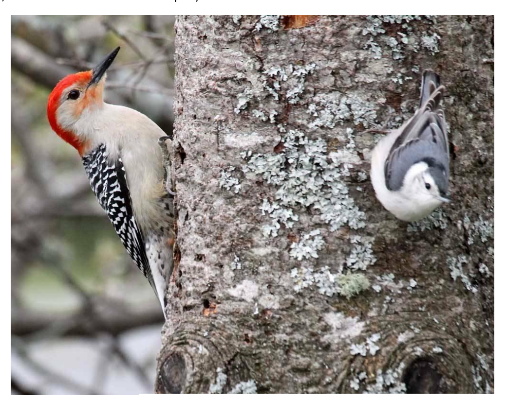
Red-bellied Woodpecker and White-breasted Nuthatch

Are there other techniques that SCO members use to promote ornithology in teaching? How much do you use ornithological examples in other courses like Behavioural Ecology? Why not contribute a short article to Picoides on your successes or failures in undergraduate teaching? It would also be nice to get a sense of how our graduate student members were taught ornithology. Perhaps there are some opinions on their most memorable learning experiences. (Is anyone interested in starting a blog on this topic?)