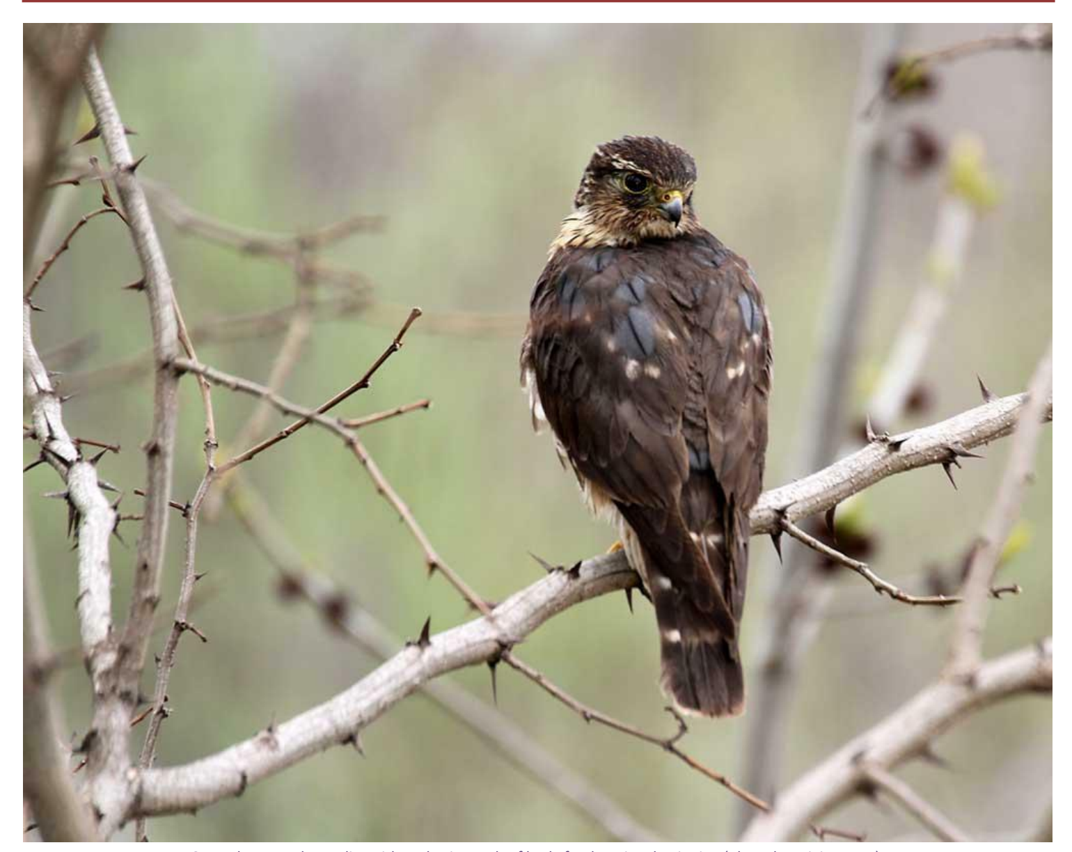
Second-year male Merlin, with prebasic moult of body feathers just beginning

Bulletin of the Society of Canadian Ornithologists • Bulletin de la Société des Ornithologistes du Canada