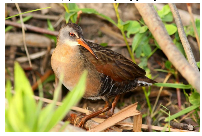
Virginia Rail

The primary objective of the GLMMP is to track population trends of marsh-nesting birds (and amphibians) through time in the Great Lakes basin (e.g., Figure 1). The program has grown to include enough sampling points to detect changes as small as 2% per year for some bird species in individual lake basins (e.g., Lake Ontario, Lake Erie). Across the entire Great Lakes basin, the data show long-term population declines for